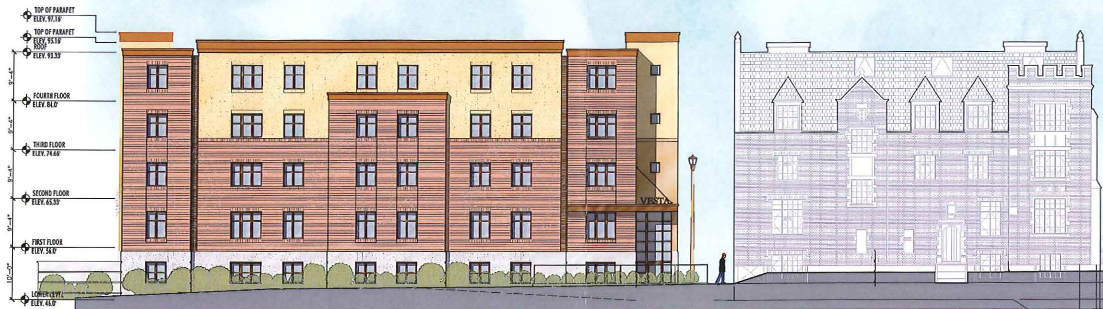
1 A5.1 SOUTH ELEVATION SCALE: 1/8" = 1'-0"