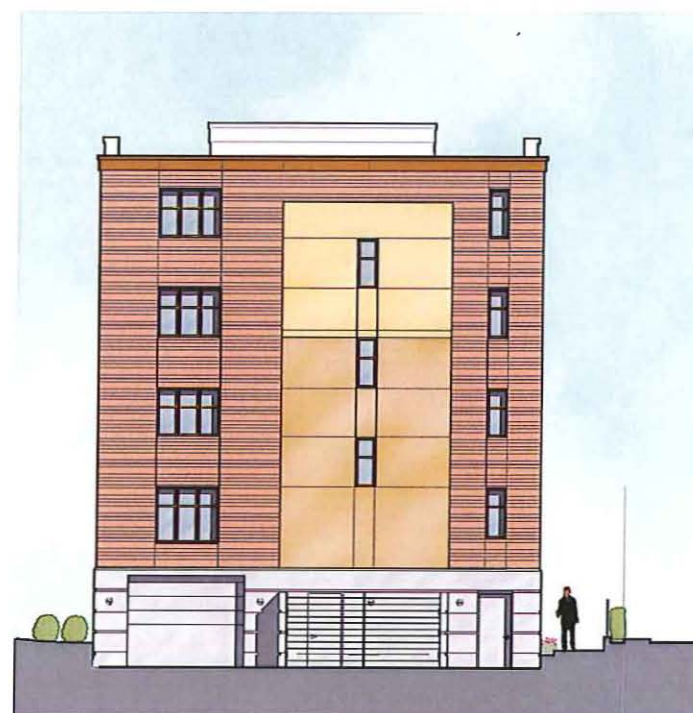
2 A5.2 WEST ELEVATION SCALE: 1/8" = 1'-0"